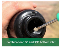
Combination 1/2" and 3/4" bottom inlet